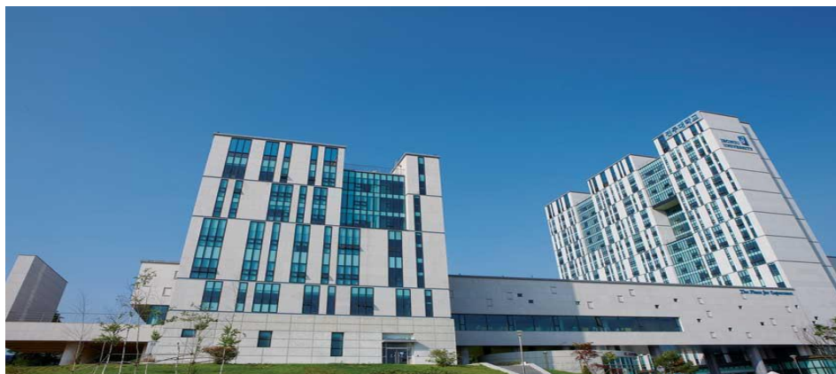
• Dormitory, 'Star Tower'