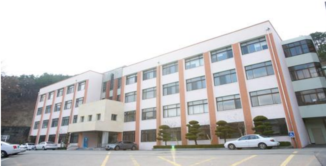
Registration Building Front View