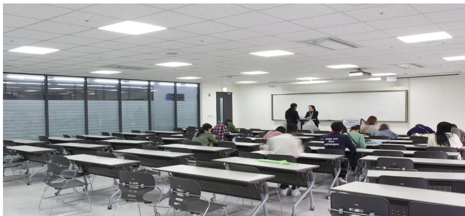
• Lecture Room