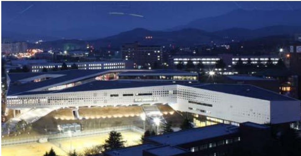
• Lecture Building, 'Star Center'